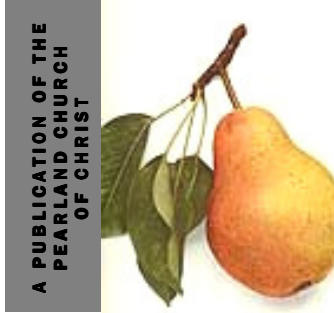
A PUBLICATION OF THE PEARLAND CHURCH OF CHRIST

Also, churches of Christ do not believe in modern-day miracles because we do not see any genuine miracles happening today. These are the kinds of miracles we read of in the Bible: a man is raised from the dead (Jn. 11), a lame man walks instantaneously (Acts 3), blind people are given their sight immediately (Mk. 10:49-52), a man’s ear is attached back to his head automatically (Lk. 22:50-51). Dear friend, you must admit these kinds of miracles are not happening today. As I