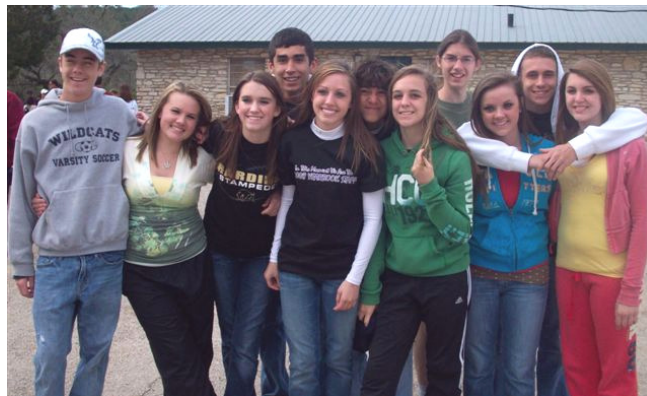
On the way to camp...they had no idea what was in store.

Eight of our teens, along with others from the Bay Area, enjoyed seeing each other again at Camp Hensel last weekend.