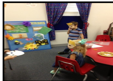
"He that hath ears to hear, let him hear."