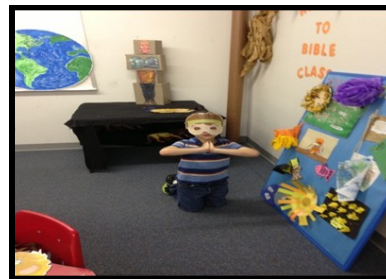
Aaron praying to God