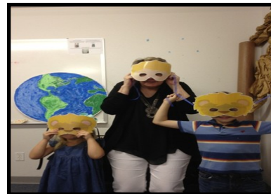
Three ferocious lions