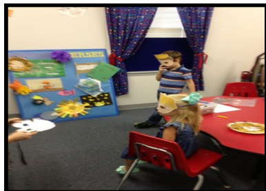
"He that hath ears to hear, let him hear."