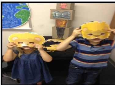
Growing up in the Lord