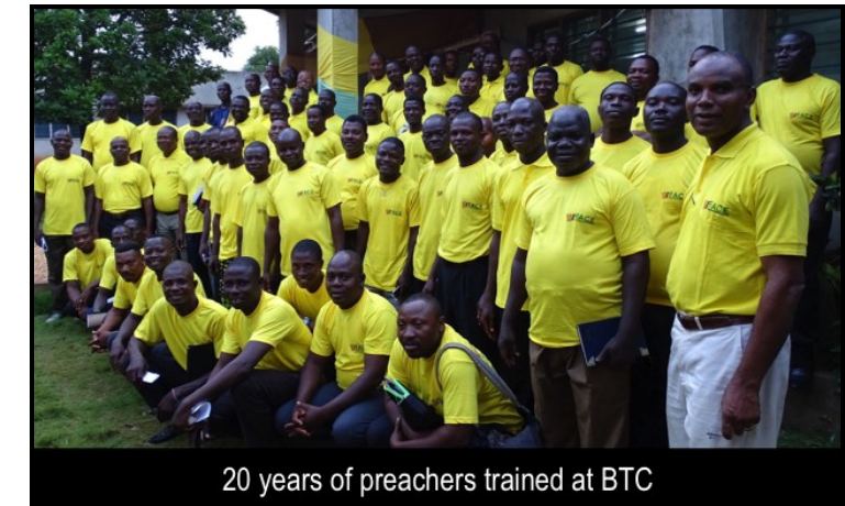
20 years of preachers trained at BTC