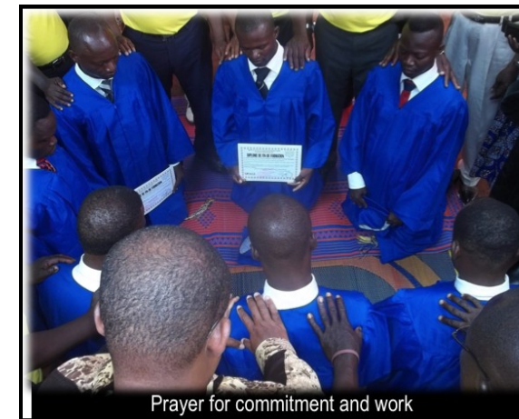
Prayer for commitment and work