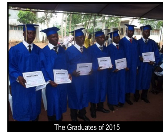
The Graduates of 2015